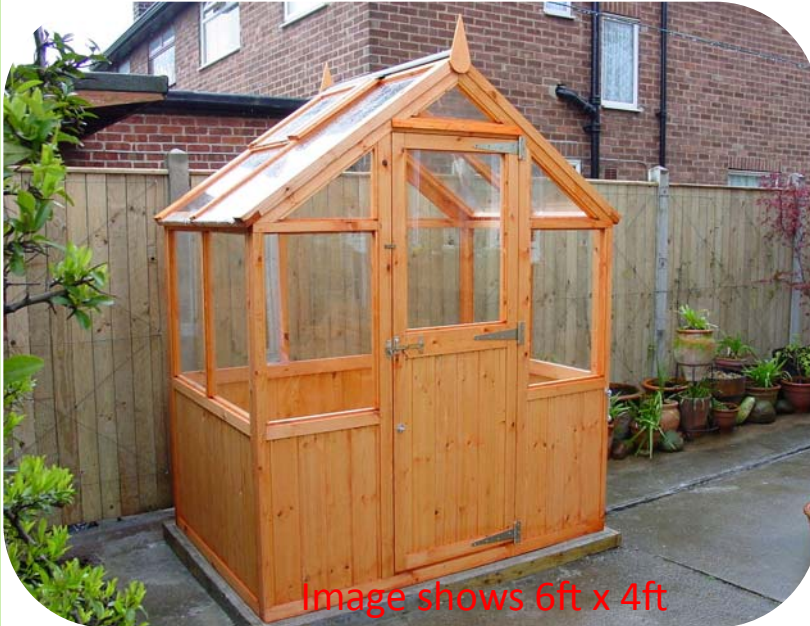
Image shows 6ft x 4ft