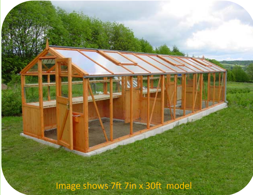
Image shows 7ft 7in x 30ft model