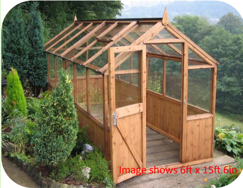
Image shows 6ft x 15ft 6in