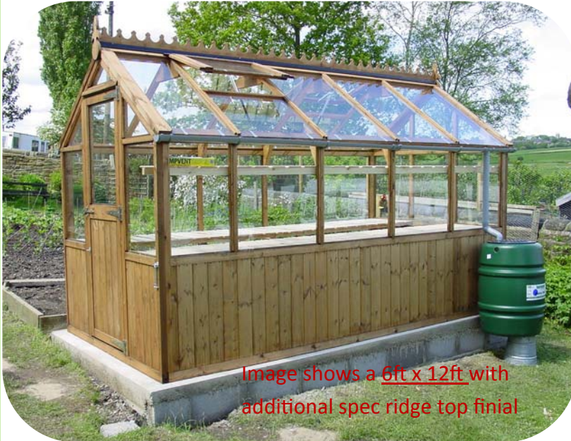
Image shows a 6ft x 12ft with additional spec ridge top finial