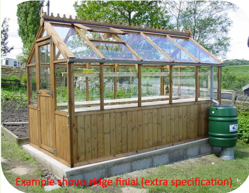
Example shows ridge finial (extra specification)