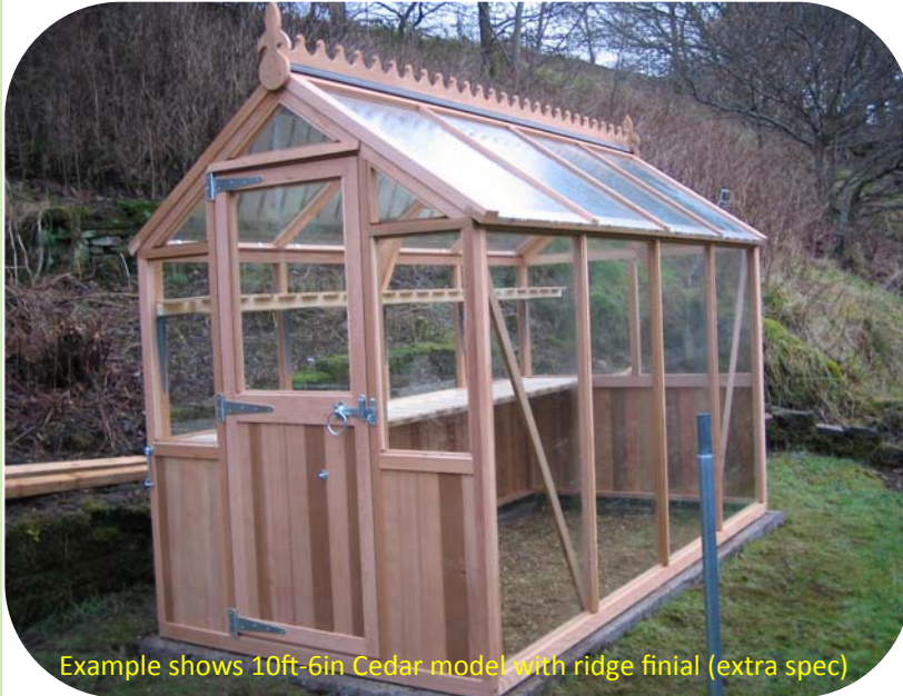
Example shows 10ft-6in Cedar model with ridge finial (extra spec)