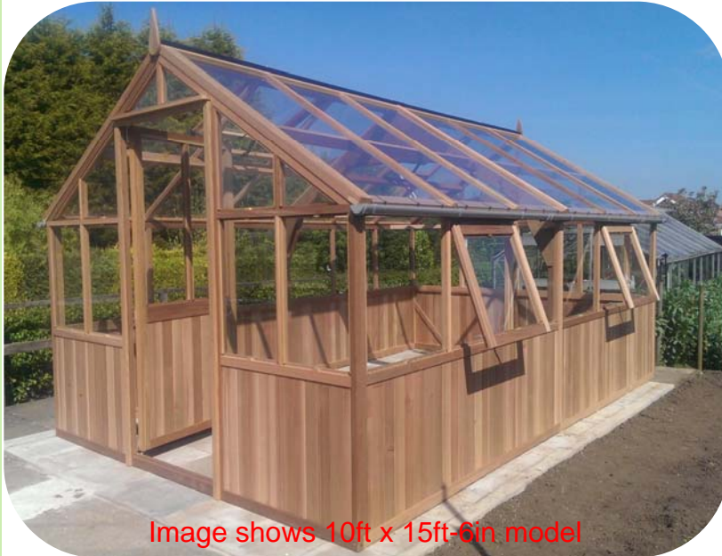
Image shows 10ft x 15ft-6in model